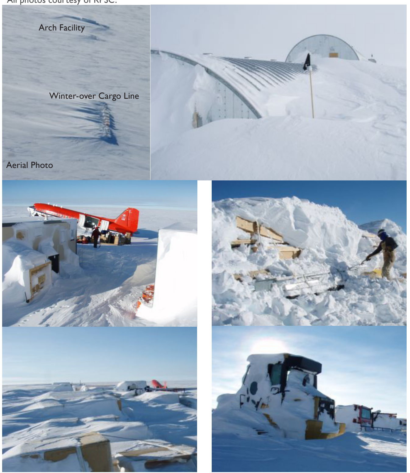
WAIS Divide Ice Core Project - Science Coordination Office • http://www.waisdivide.unh.edu Desert Research Institute, Nevada System of Higher Education • Inst. for the Study of Earth, Oceans, and Space, U. of New Hampshire